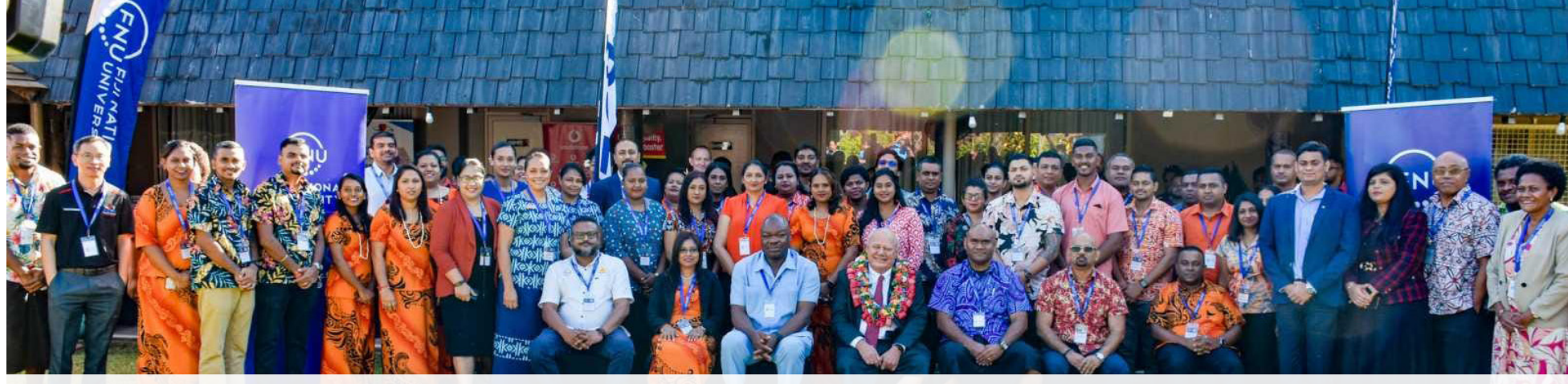
Chief Guest and Deputy Prime Minister and Minister for Tourism and Civil Aviation, Honorable Viliame Gavoka with the FNU Team and participants at the conference.